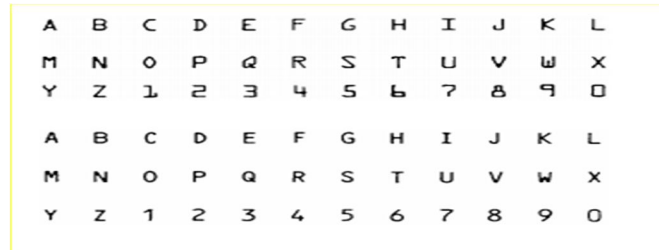
Fig 2. Standard OCR set in second generation