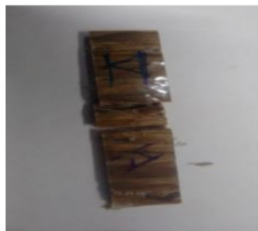
Fig 6: Sample B 60% kenaf and 40% coir