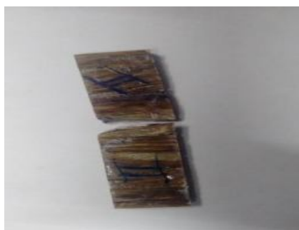
Fig 5: Sample A 60% coir and 40% kenaf

2) Compression Strength: Compression test is conducted at room condition to determine the compressive strength. The external faces of work piece are made perfectly plane. The specimen is held between the lower and the upper cross head of the C. T. M loading is applied gradually on to the specimen. The specimen undergo compression. At a particular load the needle starts to rotate anti clockwise, which is been noted as crushing load.