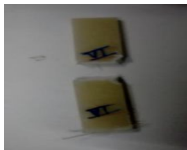
Fig 8 : Sample D 60% jute and 40% coir