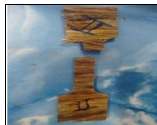
Fig 2 : Sample B 60% kenaf and 40% coir