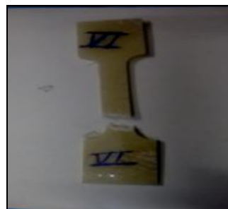
Fig 4 : Sample D 60% jute and 40% coir