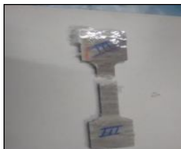
Fig 3 : Sample C 60% jute , 40% kenaf