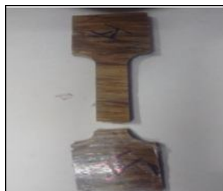
Fig 1 : Sample A 60% coir and 40% kenaf