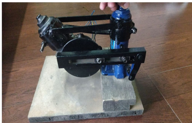
Fig. 2 Designed Hydraulic Jack

As soon as oil goes into the cylinder the piston in the cylinder starts moving up. Pump sucks the oil from tank and conveys it to the cylinder. The jack begins lifting the weight and stops after completion of stroke of the cylinder. Now after releasing the switch the vehicle remains at raised, as the return flow of the oil is stopped by the delivery valve fitted in the control unit. The relief valve reliefs the pressure if the load is exceeding the maximum lifting capacity and also if switch is not released after completion of stroke.