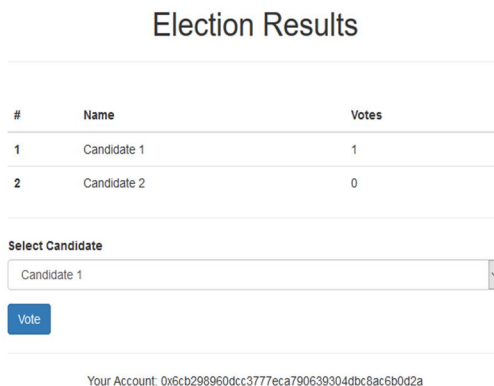
Fig 3: we can see that as we cast our vote which is kind of a transaction the ether of the account which has casted the vote reduced by some value which shows that writing costs.