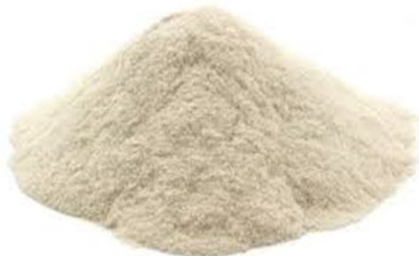
Figure 1: Xanthan gum

This anionic polysaccharide is produced by the bacteria Xanthomonas campestris . Xanthan gum's negative charge comes from its carboxylic acid (-COOH) groups, since hydrogen atoms easily dissociate from these carboxylic acid groups to form carboxylate (-COO - ) anions. Xanthan gum can also form hydrogen bonds with its numerous hydroxyl (-OH) groups. Small amounts of xanthan gum significantly increase an aqueous system's viscosity, which makes it a commonly used commercial substance. However, since the xanthan gum solution is pseudoplastic, its viscosity decreases with an increased shear rate. Xanthan gum also forms a viscous hydrocolloid when mixed with water, so it can also be considered dissolved in water. Xanthan gum hydrates immediately in cold water and is extremely stable to pH (from 2.5 to 11), heat and shear. Figure shows Xanthan gum used.