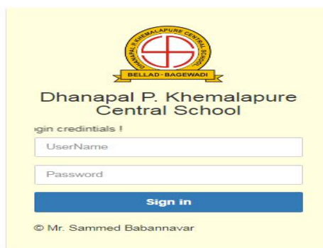
Fig. 1 Secure login to web application