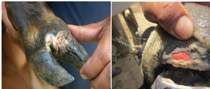
Fig. 3 Hoof and mouth diseases

Hoof and mouth disease is an infectious and sometimes viral disease that that affects cloven-hoofed animals, including domestic and wild bovids. Initial signs are dullness, inappetance, decreased milk production, and fever, followed by an increased salivation, lameness, and serous nasal discharge. As the blisters increase in size and number, soreness of the hooves leads to treading and kicking, and lesions become readily apparent. Vesicles may appear on the lips, gums, dental pad, tongue, nares, muzzle, inter digital spaces, and teats. These rupture in time and leave eroded areas.