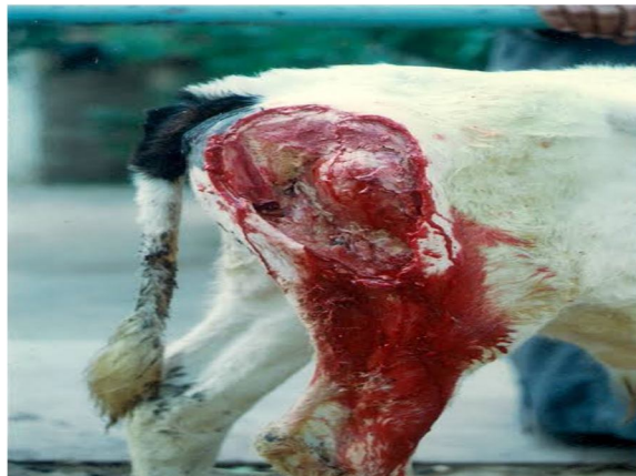
Fig. 2 Blackleg disease

Blackleg Diseases an infectious bacterial disease that affects the cow's leg which is caused by a gram-positive bacteria species called Clostridium Chauvoei . The affected leg will begin to feel hot to touch and will begin to swell slightly and also black patches will be found on and around the affected area. This will lead to the animal becoming lame and struggling to walk on it. Blackleg can, unfortunately, occur at any time of the year, though most cases occur during the warmer summer months. The nature of the blackleg disease means that treatment is extremely difficult, while the effectiveness of vaccines has been disputed. Usually, the cow will only survive for a short period after the first signs of the disease are noticed, with many dying within 12 hours.