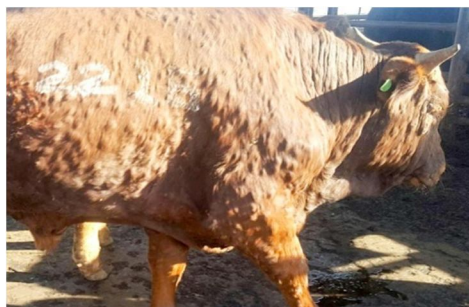
Fig. 1 Lumpy skin disease

Lumpy Skin Disease is a disease affecting cow which causes fever, depression, skin nodules and oedema, enlarged lymph nodes, also nodules on the mucous membranes, nasal and ocular discharges, milk drop, swellings in the leg and lameness. The firm nodules are up to 5 cm in diameter in the skin. These can be found on all over the body, but particularly on the head, neck, udder, scrotum and perineum. The disease has considerable economic impact due to production losses (e.g. milk drop, reduced quality of skins), movement and trade restrictions imposed on the affected areas.