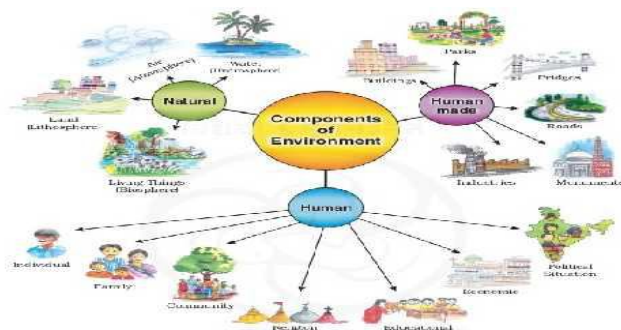
Fig. 1. Components of Environment