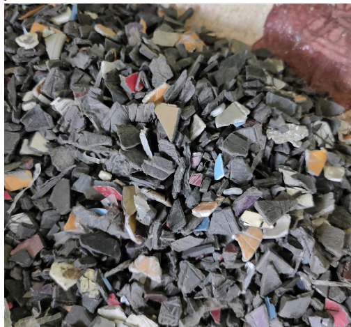
Fig. 1 Waste Vehicle fiber body