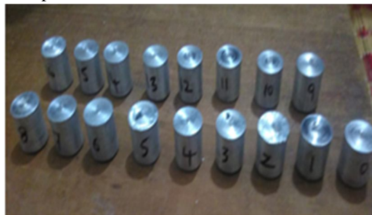
Fig 2: Compression Test Specimen

Compression test was carried out on Universal testing machine in accordance with ASTM E9 standard at room temperature. The specimen is as shown in Fig 2. The height of specimen is 20mm and diameter 20mm.