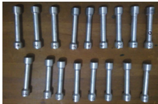
Fig 1: Tensile Test Specimen

Tensile test was carried out on Universal testing machine. The test specimens were prepared as per ASTM E8 standard as Shown in Fig 1. Tensile test specimen has gauge length of 60mm and diameter of 12mm. The test was conducted under static load condition for tensile strength.