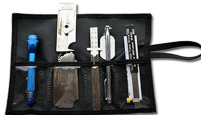
Fig.2(b) Inspection tool kit [8]