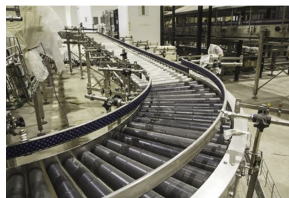
Fig.2(d) Use of conveyer belts [10]