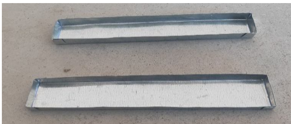
Fig3: Die Casting Process

In conventional die casting method, reinforced sisal fiber is mixed into the epoxy resin by hand mixing machine. Mixing machine is the most important element of this process. After the mechanical mixing, the mixer is directly transferred to a shaped mould prior to complete solidification. The essential thing is to create the good wetting between particulate resin and sisal fiber. The distribution of the reinforcement in the final solid depends on the wetting condition of the reinforcement with the melt, relative density, rate of solidification etc.