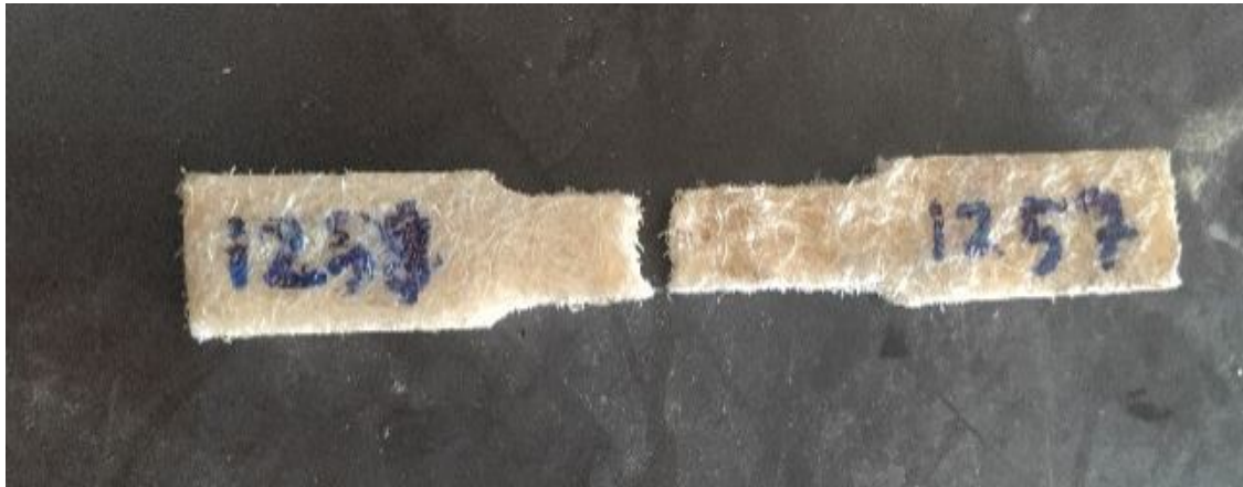
Fig3: Tensile test specimen

The materials used for engineering applications are usually selected on the basis of their properties, such as ultimate tensile strength, yield strength, and modulus of elasticity. The tensile test is the most common method for determining these mechanical properties. In the present work, a tensile test was conducted on a universal testing machine (UTM) and the developed composite specimen 1 were prepared as per ASTM standards.