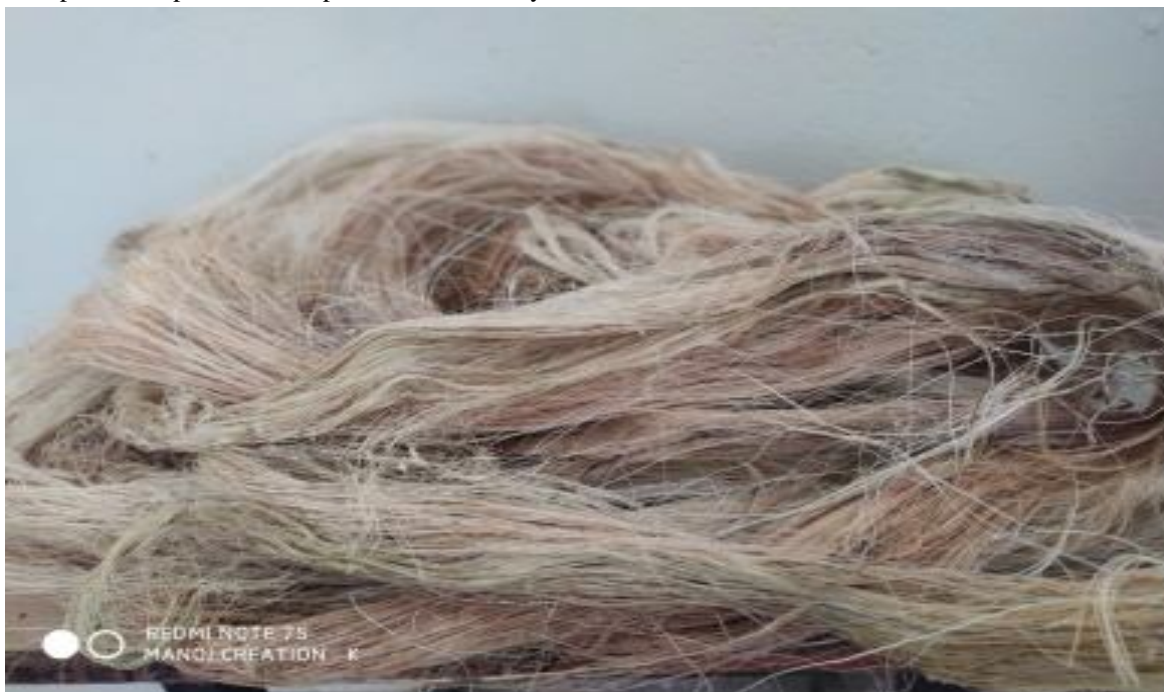
Fig1: Sisal Fiber

Sisal is a precipitation hardening composite material, containing sisal fiber and epoxy resin as its major compositing elements. It has good mechanical properties and exhibits good composite ability. It is few of the common composite of sisal fiber for general purpose use. Hardener and Wax are used as additives. Base material sisal fiber were bought in natural armors and are weighed as per the composition and are cut into small piece for the convenience of placing them inside the crucible are heated to 75 oC in an induction furnace for half an hour. Mixing material .Epoxy resin and hardener are also weighed separately as per the weight ratio and are preheated to atmospheric temperature to improve the wettability of the material.