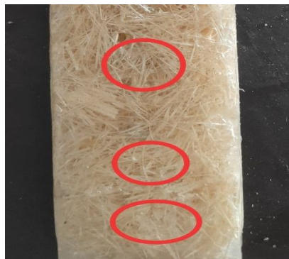
Fig5: Hardness test specimens

In the present work, a Brinell hardness tester with an indenter diameter of 5 mm was used to determine the hardness of the specimens A of the hybrid composite. A load of 5 kN was applied for 30 seconds on each specimen. The Brinell hardness number (BHN) was calculated by dividing the load applied by the surface area of the indentation. The BHN values obtained for the specimens 1 were 69, 67 and 66 respectively