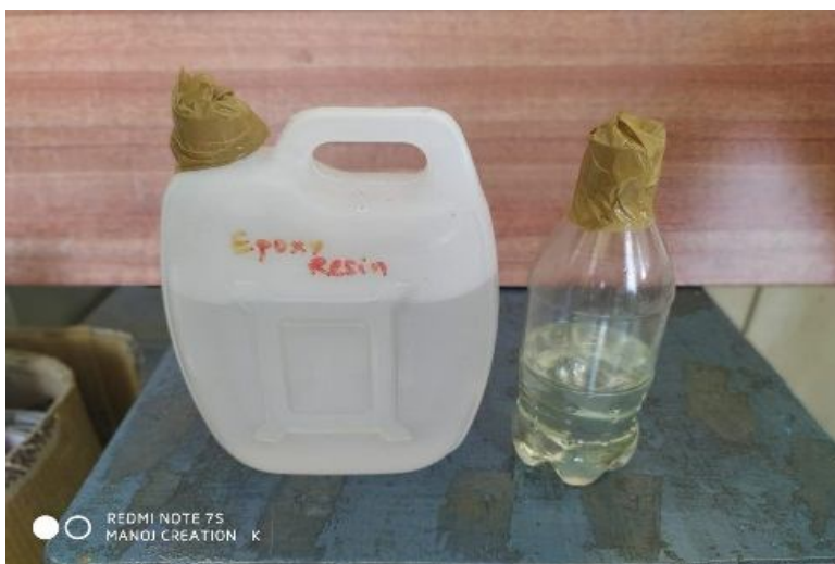
Fig2: Epoxy Resin

The properties of Epoxy resin are Good hardness development, High gloss, Best UV resistance properties, Low viscosity, Long pot life, Water and chemical resistance.