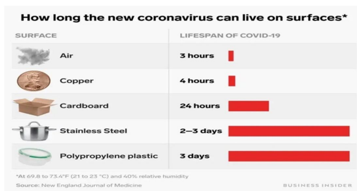
Fig 2. life span Covid-19 on different material surfaces

There are seven types of corona virus out of which four viruses causes mild cough and cold. SARS, MERS are the class of corona viruses which was already spread in all over world-wide and dangerous to human health. The SARS-CoV-2 is most epidemic and dangerous virus most causing corona disease. It is regarded as NOVEL Corona virus due to human never seen before. The immunity system of human being has been developing since last 20 million years, but SARS-CoV-2 viruses destroy the power and capability of human immunity system [5]. It is evident that the life time of corona virus ranges from 3 hours to 72 hours. It depends on the contact layer with which corona virus come in contact with hard, porous, non-porous, metallic, soft structure material [6]. In 2007 Vincent C. C. et al., suggested that the presence of large reservoir of SARS-CoV-like viruses in horseshoe bats, together with the culture of eating exotic mammals in southern China is a time-bomb. These viruses are well known to undergo genetic recombination (375) which may lead to genotypes and outbreaks [7].