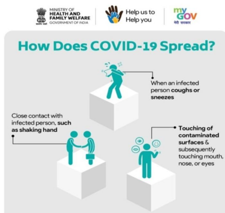
Fig. 3 shows How Covid-19 Spread [8]

Where Y is value on vertical axis, B is value in horizontal axis, X is power/exponent factor.