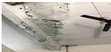
Dampness due to rain water

Respective building is educational building of Dr.JJMCOE,Kolhapur ( ETC and ETRX building) located at Shirol-wadi road constructed in year 2000 and age of the building in current is 19 years.This building is having basement and three floor in superstructure including ground floor ( B+G+2 ).Stories height of different floors is B=3,GF=8,FF=4,SF=4 (In meters). And the building is highly affected by monsoon.