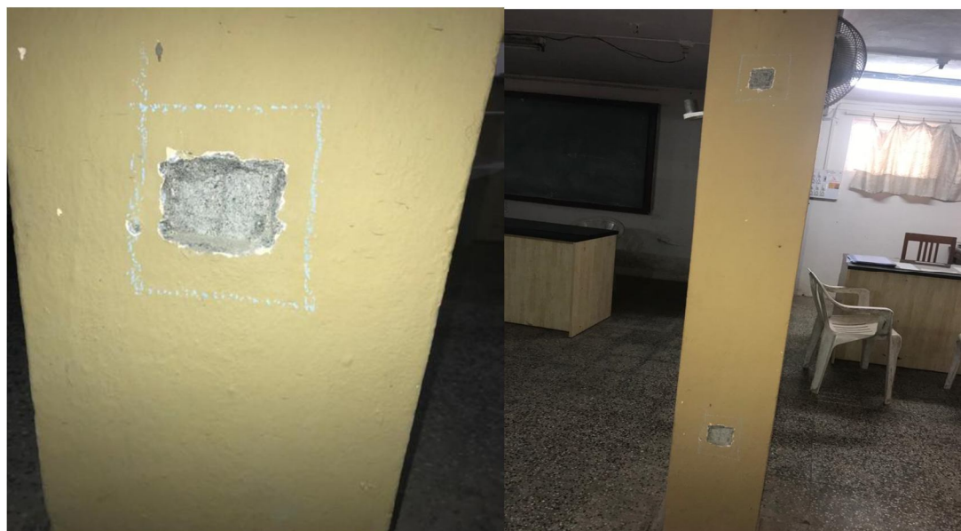
Plaster removed Structural members.

As the body is pushed, the main spring connecting the hammer mass to the body is stretched. When the body is pushed to the limit, the latch is automatically released and the energy stored in the spring propels the hammer mass towards the plunger tip. The mass impacts the shoulder of the plunger rod and rebounds.