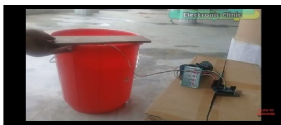
Fig.2 system setup of real time hardware

In this Water level monitoring using ultra sensor, we use an ultrasonic sensor-HC-SR04 to detect the level of the water and we display the level of the water of using 5LED's ,these LEDs will display the level of the water when an level of the water is detected by an ultrasonic sensor -HC-SR04 and this data is then send to the arduino UNO, now the arduino will process the data and sends the power to LEDs according to the water level ,and the LEDs will glow according to the water level and displays the level of the water level.