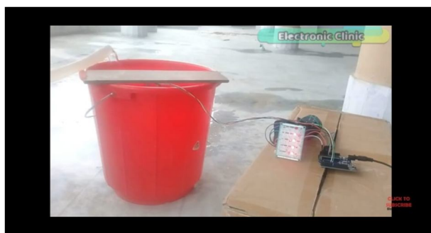
Fig .6 indication of Water Level Above 50%