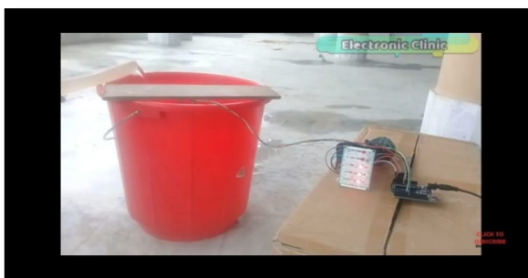
Fig.5 indication of Water Level At 50%