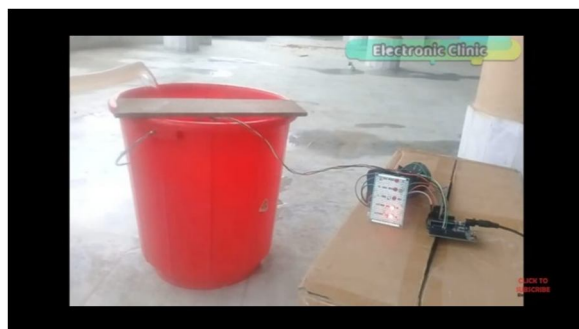
Fig. 4 indication of Water Level Below 50%

To design this we used materials of low cost. We tried to design the system in such a way that the components are easily available and when connected together it will prevent the wastage of water .The whole system operates automatically. So it does not require any expert person to operate it. This system shows the different water level indications through LED's