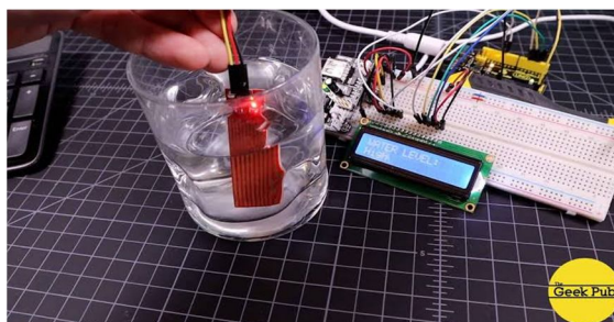
Fig.1 water level indicator

A water level indicator is used to show the level of water in an overhead tank, this keeps the user informed about the water level at all the time and avoids the situation of water running out when it is most needed. Indicator circuit also have alarm feature, it not only indicate amount of water Present in overhead tank but also gives an alarm when the tank is full. The purpose of a water level indicator is to gauge and manage water level in a water tank. The control panel can also be programmed to automatically turn on a water pump once level get too low and refill the water back to adequate level. Water level indicator is used to overcome overflow problems, to prevent wastage of water, to prevent wastage of energy, for sustainable use of water and judicious use of electricity, attention and observation.