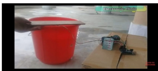
Fig.2 system setup of real time hardware

In this Water level monitoring using ultra sensor, we use an ultrasonic sensor-HC-SR04 to detect the level of the water and we display the level of the water of using 5LED's ,these LEDs will display the level of the water when an level of the water is detected by an ultrasonic sensor -HC-SR04 and this data is then send to the arduino UNO, now the arduino will process the data and sends the power to LEDs according to the water level ,and the LEDs will glow according to the water level and displays the level of the water level.