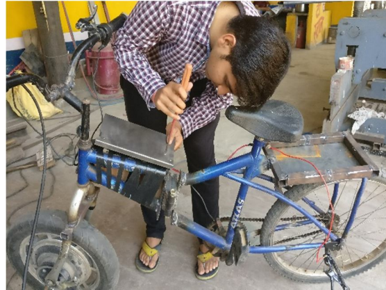
Fig 6:- Assembling the parts