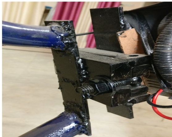
Fig 4:- Folding Joint in folded state

Now for installing the folding system into the bicycle the front frame was laterally cut at an angle of 20 degrees from the vertical. Two rectangular plates of 5 mm thickness and 20 mm in length were welded on both sections of the frame that was cut. And then the folding system was welded over the plates. The plates were introduced so as to compensate the distance between the two bars of the frame. The plates provides singularity to the frame.