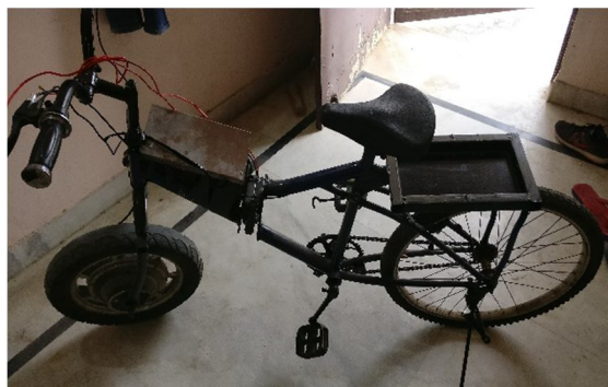
Fig 1:- Unfolded state of the bicycle