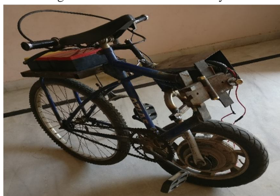
Fig 2: - Folded state of bicycle