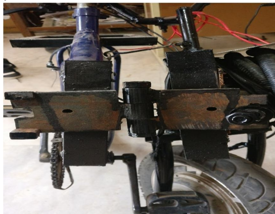
Fig 5:- Folding joint in unfolded state

Now for installing the folding system into the bicycle the front frame was laterally cut at an angle of 20 degrees from the vertical. Two rectangular plates of 5 mm thickness and 20 mm in length were welded on both sections of the frame that was cut. And then the folding system was welded over the plates. The plates were introduced so as to compensate the distance between the two bars of the frame. The plates provides singularity to the frame.