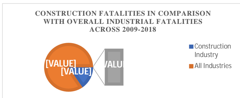
Figure 2. Percentage of Deaths in the Construction Industry in Comparison with Total Number of Fatalities across all the industries in the United States from 2009-2018

Table 2 & figure 2 shows the total number of deaths in the construction industry and all industries as a whole in the United States. Total number of deaths in the construction industry is divided by the total number of deaths in all the industries to determine the percentage of construction related fatalities across the United States across the 10-year period. Similarly, the percentage for each individual year is also calculated.