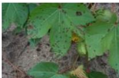
Figure No. 3: Bacterial Blight

Xanthomonas campestris pv. Malvacearum Bacterial blight starts out as angular leaf spot with a red to brown border [2],[3],[4]. The angular appearance is due to restriction of the lesion by fine veins of the cotton leaves. Spots on infected leaves may spread along the major leaf veins as disease progresses, leaf petioles as shown in Fig 3. The angular leaf spot, results in premature defoliation and stems may become infected resulting in premature defoliation