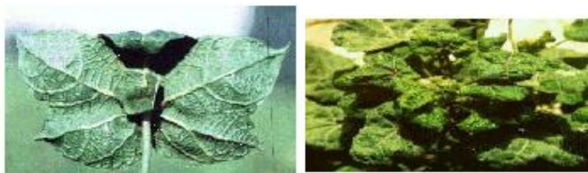
Figure No. 2: Curl Gemini virus

Cotton leaf curl Gemini virus (CLCuV) causes a major disease of cotton in Asia and Africa [2],[3],[4]. Leaves of infected cotton curl upward Fig 3. and bear leaf-like enations on the underside along with vein thickening Fig 3. Plants infected earlier in the season are stunted and yield is reduced drastically. Severe epidemic of CLCuV have occurred in Pakistan in the past few years, with yield losses as high as 100% in fields where infection occurred early in the growing season. Another cotton Gemini virus, cotton leaf crumple virus (CLCrV), occurs in Arizona, California, and Mexico. CLCrV symptoms are distinguishable from CLCuV symptoms in that infected leaves curl downward accompanied