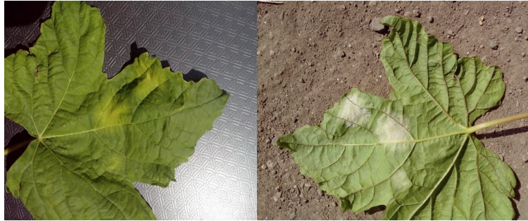
Figure No. 5: Grey Mildew on Cotton

Plasmopara viticola is the pathogen responsible for Downey mildew disease. It creates the white spots on the back side of leaves. As seen in first stage white spots are present on backside of leaf. Exactly on the opposite side (upper side) of white spot (downside), yellow spot comes. Primary stage of yellow spot development is shown in figure