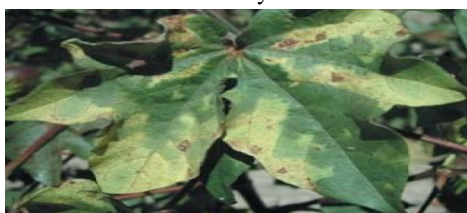
Figure No. 6: Verticillium Wilt

Verticillium wilt of cotton is caused by Verticillium dahlia , a soil borne fungus that enters the roots and grows into the vascular system of the plant. Vascular discoloration or browning extending throughout the stem and into the petioles. Plants rarely wilt but may defoliate immaturely at the end of the season. Leaves develop a characteristic yellow mottle, at the edges and between the veins. Lower leaves are usually affected first. Dead tissue develops at the leaf edges and may replace the mottled areas. The mottle can be diffuse or angular. Environmental factors Favored by cool seasons.