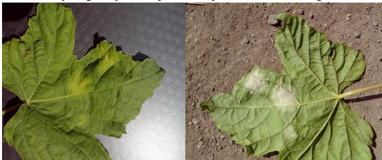
Figure No. 5: Grey Mildew on Cotton

Plasmopara viticola is the pathogen responsible for Downey mildew disease. It creates the white spots on the back side of leaves. As seen in first stage white spots are present on backside of leaf. Exactly on the opposite side (upper side) of white spot (downside), yellow spot comes. Primary stage of yellow spot development is shown in figure