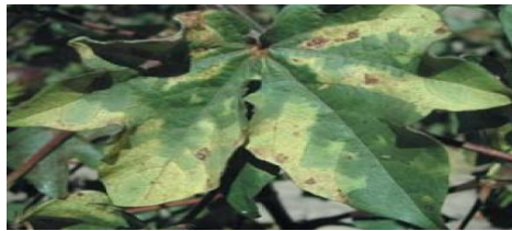
Figure No. 6: Verticillium Wilt

Verticillium wilt of cotton is caused by Verticillium dahlia , a soil borne fungus that enters the roots and grows into the vascular system of the plant. Vascular discoloration or browning extending throughout the stem and into the petioles. Plants rarely wilt but may defoliate immaturely at the end of the season. Leaves develop a characteristic yellow mottle, at the edges and between the veins. Lower leaves are usually affected first. Dead tissue develops at the leaf edges and may replace the mottled areas. The mottle can be diffuse or angular. Environmental factors Favored by cool seasons.