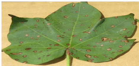
Figure No.1: Alternaria Leaf Spot

As shown in Fig 1, small, brown, round or irregular spots measuring 0.5 - 3 mm in diameter and broken centers appears on the affected leaves on the plant. Affected leaf become dry and fall off [3], [4]. The disease may cause cracks on the stem. The infection spreads to the fruit finally falls off.