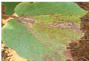
Figure No. 4: Cerco Spora

The disease affects older leaves of mature plants The spots are round/ irregular in shape yellowish brown, with purple, dark brown or blackish and white centres affected leaves become pale in colour and finally fall off [2],[3],[4] as shown in Fig 4.