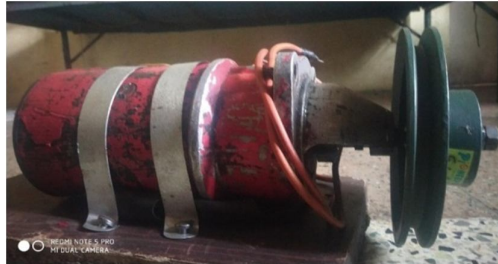
Figure no 9- Starter motor

Automobile self starter also known as starter motor or simply starter is an electric motor initiates rotational motion in an internal combustion engine before it can power itself.. One of the important feature of these electric motors is a soft on/off electronic switch for easy operation. Automobile self starter or starter motor are known for flawless performance and high durability. These parts find application in trucks, tractors, cars, bikes and ATV of all models and makes. These starter motors are equipped with various high quality components made by renowned companies. These motors are highly dependable and economically priced. These are motors are capable to suit various application