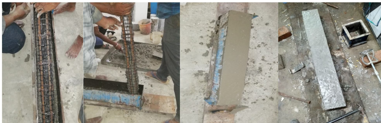
Figure 1 Casting of beams