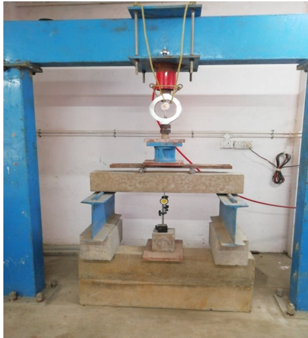
Figure 2 Testing of beam

Flexural modulus is calculated from the slope of the stress vs strain curve. These two values can be used to evaluate the ability of the sample to withstand flexure or bending forces. The two most common types of flexure test are three - point and four - point flexure bending tests. A three - point bending test consists of the sample placed horizontally upon two points and the force applied to the top of the sample through a single point so that the sample is bent in the shape of a "V". A four - point bending test is roughly the same except that instead of the force applied through a single point on top, it is applied through two points so that the sample experiences contact at four different points and is bent more in the shape of a "U".