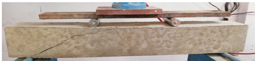
Figure 6 Cracked pattern of two layer geogrid reinforced beam