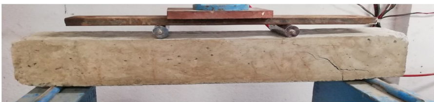
Figure 7 Cracked pattern of geogrid confined beam