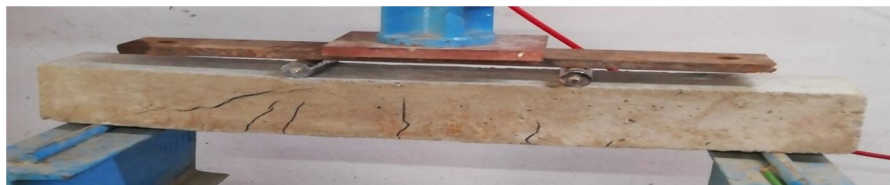
Figure 5 Cracked pattern of conventional beam

The crack pattern of the conventional RCC beam and the geogrid reinforced RCC beams are shown in Figure 5, 6 and 7. It was found that the conventional beam has a greater number of cracks when compared to the other beams. While comparing two-layer geogrid reinforced RCC beam and geogrid confined RCC beam, the geogrid confined beam has lesser number of cracks with the depth of propagation of crack being small.