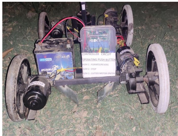
Fig. 3 Rear view of machine