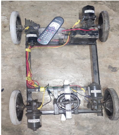
Fig. 2 Top view of machine

After studying all this it is conclude that the cutter machine is very useful to the people and more environmental friendly. The remote control is the main feature that controlled the direction of machine and cutting motor. A 12V battery and control circuit is control the DC motor and wheel and blades. In the project for future planning solar panel is used as the backup power and stored at the seal lead acid battery. The smart cutter machine easier to handle since the movement will control by using remote control.