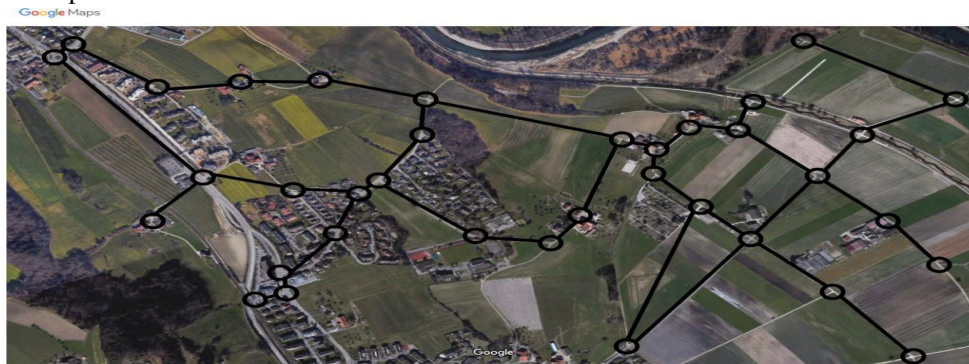
Fig 3. Demo view of map with bin placement and path marked

Another key component of the system is the shortest path finding system (SPFS) which will make it very effective in case of multiple collections in the area. Its functionality includes the bin id, maps api and a shortest path finding algorithm. Once the system is made aware that there is a set of bins from a specific area which need collection, the system will check their bin id and with the help of map api which will have the placements of all the bins marked, it will generate the shortest path connecting them and will provide that to the driver responsible for collection of the bins.