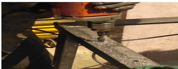
Fig.2: Drilling Process

Hand drill is used to hole the L angle rods. The diameter of the hole is 8mm.