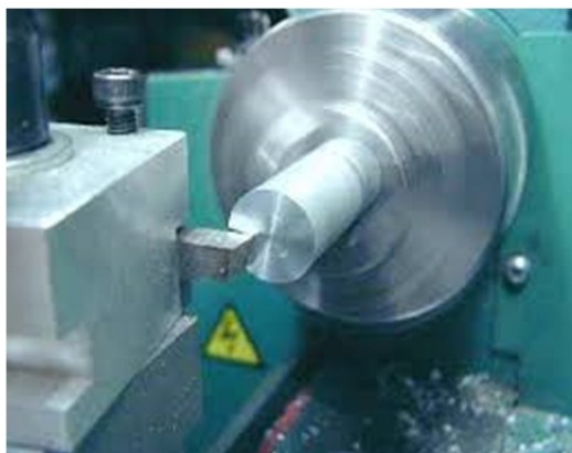
Fig.3: Facing Operation

Facing is a lathe operation in which the cutting tool removes metal from the end of the work piece or a shoulder. Facing is a machine operation where the work is rotated against a single point tool. A work piece may be held in a 3, 4, or 6 jaw chucks, collets or a faceplate.