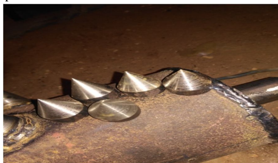
Fig.4: Grinding Operation

Grinding is an abrasive machining process that uses a grinding wheel as the cutting tool, is capable of making precision cuts and producing very fine finishes. The grinding head can be controlled to travel across a fixed work piece or work piece can be moved while the grind head remains in a fixed position.