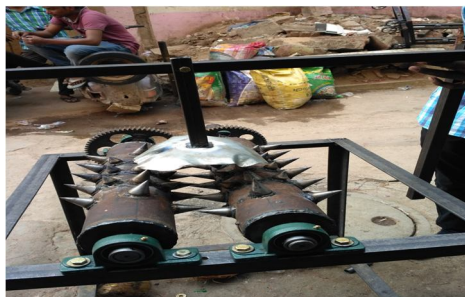
Fig.5: Assembly of Mechanical Parts

Frame is stable structure it weights all the other parts of machine. The frame can hold approximately 100kgs. Then rollers which are welded with spikes which is about 10kgs each. The gears are inserted into the shaft. The gears are tightly fixed using screw between shaft and gear. And it is fixed using L angle tool. The each gear is fixed to each shaft tightly. Now the ball bearings are fixed on the frame by using nut and bolt using different screw drivers, the four bearing are used for four sides. The shafts are inserted into the ball bearing such that meshing of gears can happen easily. The shaft are inserted in the bearing are fixed by using L angle tool. To the large length of shaft a handle is arranged such that it is easy for rotation. A nut and bolt fitting is there in between shaft and handle. Holder is fixed in the middle part of the one side of the frame. It is a simple holder which is movable up and down. Thus the assembly of the machine a clear assembly can be seen below.