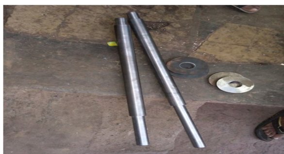
Fig.4: Cylindrical Solid Shaft