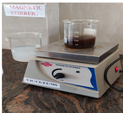
Fig -4: Magnetic stirrer

The percentage removal of COD from the synthetic wastewater was calculated.