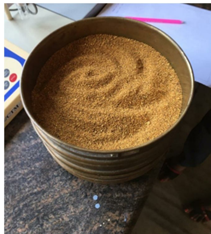
Fig- 3: Sieving the dried peels