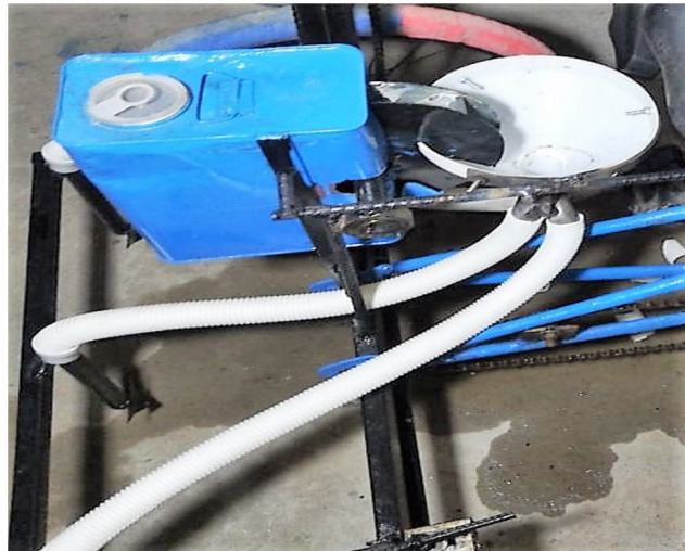
Figure. Seed sowing