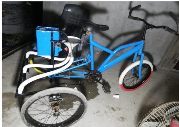
Figure. Assembled view of Multipurpose Agriculture Vehicle