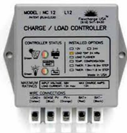
Fig 2.2. Charge Controller