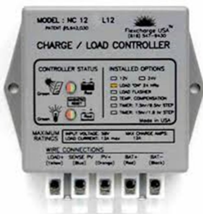
Fig 2.2. Charge Controller