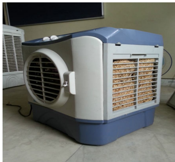
Fig 2.3. Photovoltaic Air Cooler

The figure 2.3 shows the Photovoltaic air cooler that we made.