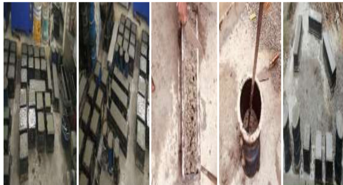
Fig. 7.2 Casting of moulds

Iron-Steel mould was used for casting the specimen, before casting oiling was done on the inner surfaces of the moulds, Concrete was mixed well by machine and it was poured in to moulds in layers and compacting it adequately so that the concrete fills the entire volume. The first step is proper mixing to avoid loss of water ensure that the concrete is homogeneous, uniform in colour, consistency and entire amount of concrete is poured in to the mould without any air voids. The pouring of concrete is done in such a way to avoid segregation while being discharge in to the mould.