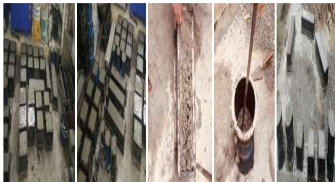
Fig. 7.2 Casting of moulds

Iron-Steel mould was used for casting the specimen, before casting oiling was done on the inner surfaces of the moulds, Concrete was mixed well by machine and it was poured in to moulds in layers and compacting it adequately so that the concrete fills the entire volume. The first step is proper mixing to avoid loss of water ensure that the concrete is homogeneous, uniform in colour, consistency and entire amount of concrete is poured in to the mould without any air voids. The pouring of concrete is done in such a way to avoid segregation while being discharge in to the mould.