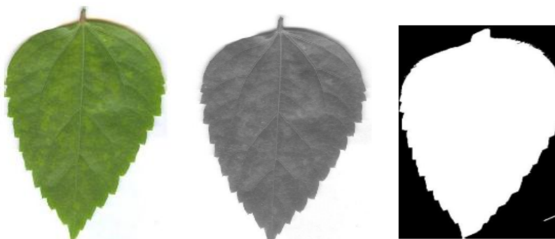
Fig: a) Test Leaf Image (Hibiscus) b) Gray Scale Image c) Leaf Image after morphological operations

The images were initially pre-processed and then the features were extracted from each leaf image with the help of the above mentioned equations. Separate pre-processing steps were employed for color, texture based GLCM, GRLM and geometrical feature based analysis. Sample testing procedure images as shown below in fig.