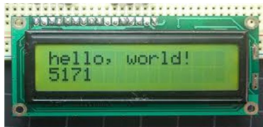
Fig 3: LCD display

A liquid-crystal display is a flat-panel display or another electronically modulated optical device that uses the light-modulating properties of liquid crystals combined with polarizers. Liquid crystals do not emit light directly, instead of using a backlight or reflector to produce images in color or monochrome