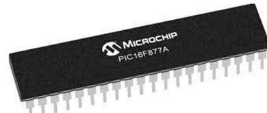
Fig.3 PIC16F877A microcontroller

5) PIC16F877A : It is the microcontroller used to control the whole system.