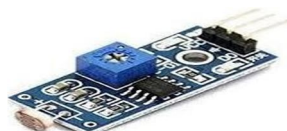
Fig.1 LDR sensor