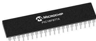
Fig.3 PIC16F877A microcontroller

5) PIC16F877A : It is the microcontroller used to control the whole system.