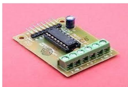
Fig.4 L293D motor driver

8) L293D Motor Driver : It is used to drive dc motor.