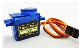
Fig: Servo motor

Servo motor is used to rotate the water tank 180 degrees. When the robot reaches the fire and stops then this servo motor activates and rotates the water tank.