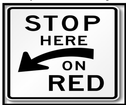
Fig.1: Stop here on Red.