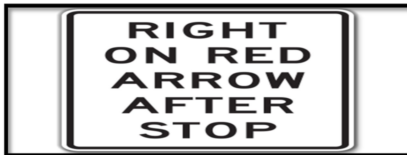
Fig.4: Right on Red Arrow after Stop.