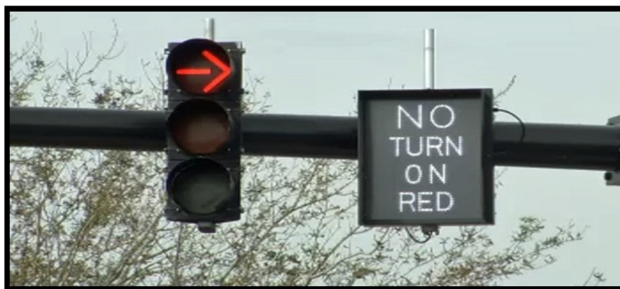
Fig.2: No Turn on Red.