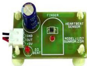
Fig.4 Heart rate sensor

This sensor gives the digital output of heart beat when a finger is placed there on. When the sensor starts, the LED flashes in unison with the beat. The output of heart rate generated is in Beats per Minute (BPM) rate.