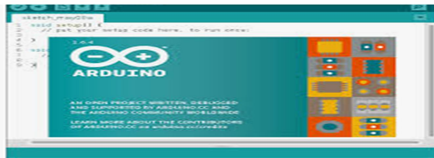
Fig.7 Arduino platform

Arduino is an open-source platform used for manages electronics projects. Arduino consists of both a physical programmable circuit card (often mentioned as a microcontroller) and a bit of software, or that runs on your computer, wont to write and upload code to the physical board. IDE (Integrated Development Environment).The Arduino hardware and software was designed for artists, hobbyists, hackers, newbie's, and anyone curious about creating interactive objects or environments. Arduino can interact with buttons, LEDs, motors, speakers, GPS units, cameras, the web, and even your smart-phone or you're TV! This flexibility combined with the very fact that the Arduino software is free of cost, the hardware boards are cheap, and both the software and hardware are easy to find out has led to an outsized community of users who have contributed code and released instructions for an enormous sort of Arduino-based projects. There are many sorts of Arduino boards which will be used for various purposes. Some boards look a touch different from the one below, but most Arduino have the bulk of those components in common: