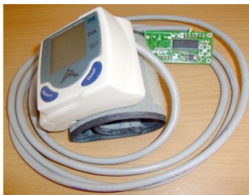
Fig.5 Blood Pressure sensor

The Blood Pressure sensor is fully automatic, easy to operate, intelligent device which shows systolic, diastolic and pulse readings. Its compact design fits over the wrist like a watch. Easy to use wrist style eliminates pumping. It gives serial output data for external circuitProcessing or displays. Blood pressure is the measure of force that pumps blood against the walls of the arteries as blood flows through them. Blood pressure is the pressure of distributing blood on the walls of blood vessels. The normal range of the human blood pressure should not more than 120 over 80 and less than 140 over 90. It is measured in millimeter of mercury (mmHg). The blood pressure displays electronic pressure and pulsating sensor to identify signal on digital form. The screen consists of two parts. The top of the screen is used to measure systolic blood pressure and the lower part of the screen is used to measure diastolic blood pressure.