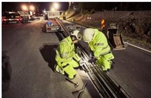
Fig.2 Working discretion of studied system