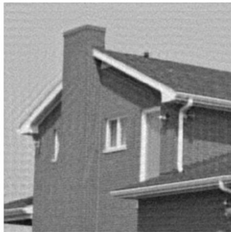
Fig. 4 Fine-Granularity Image

Gradually decrease the regularization parameter to achieve spatial adaptation. Analogy between statistical physics and image processing is used to illustrate the asymptotic behavior of both local and nonlocal regularized filters. It is shown that regularization parameter in image plays a similar role of temperature parameter in statistical physics and different structures in image processing.