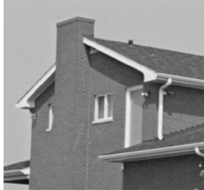
Fig. 3 Original Image

It is proved by applying Eigen value analysis to the linear system. Eigen vectors associated with blurring operator \mathbf{H} and the corresponding Eigen values \lambda_{mn} . the term fine-granularity is used to emphasize the increased flexibility in manipulating the procedure of relaxation control. In addition to r-times Landweber iteration. It is feasible to combine it with a spatially adaptive control strategy. Original image of cameraman is shown in figure 3 and the output image obtained using fine-granularity is shown in figure 4.