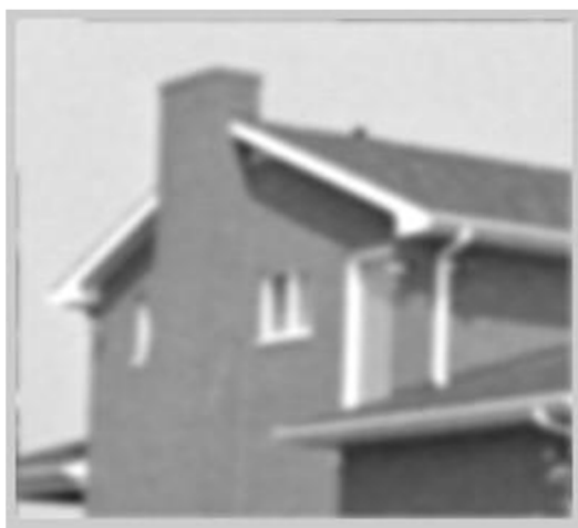
Fig. 2 Denoised Image Using Iterative Regularization

The value of unified projection-based framework is that it allows us to understand various image deblurring algorithms in a principled manner. From this perception, many deblurring algorithms based on different heuristics and can be viewed as a combination of sequential and parallel projections strategies, any iterative image deblurring algorithm has been called relaxation control, which is abstractly equivalent to regularization.