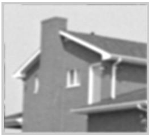
Fig. 2 Denoised Image Using Iterative Regularization

The value of unified projection-based framework is that it allows us to understand various image deblurring algorithms in a principled manner. From this perception, many deblurring algorithms based on different heuristics and can be viewed as a combination of sequential and parallel projections strategies, any iterative image deblurring algorithm has been called relaxation control, which is abstractly equivalent to regularization.