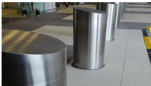
Figure No. 1