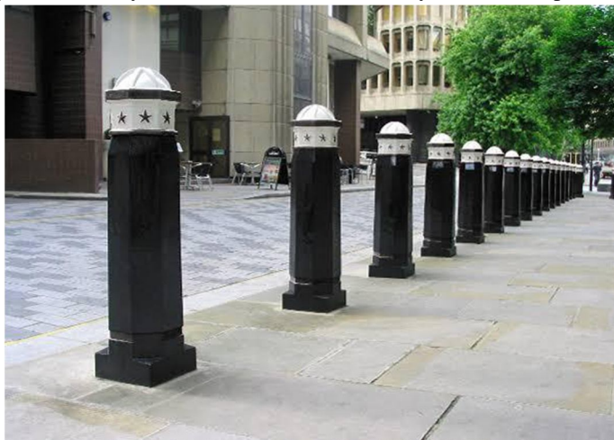
Figure No. 2