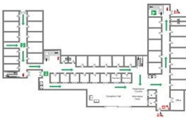
Beacon Monitoring System (Fig 2)