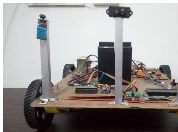
Figure 7. An image showing the complete model of multi-senor approach based car.