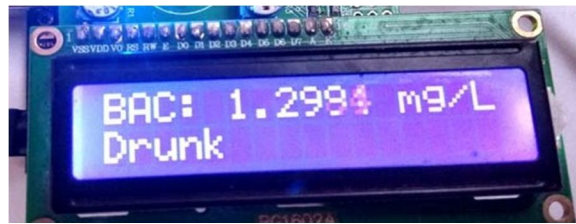
Figure 5. An image showing the concentration of alcohol.