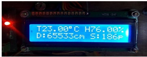
Figure 4. An image showing the temperature, humidity and distance observation by temperature and LiDAR sensor respectively.