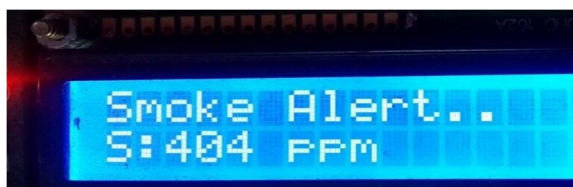
Figure 2. An image showing the Smoke alert when the level of smoke is exceed.