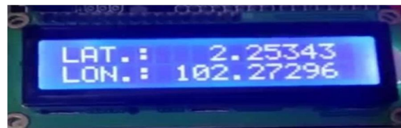
Figure 6. An image showing the latitude and longitudes of the vehicle location.