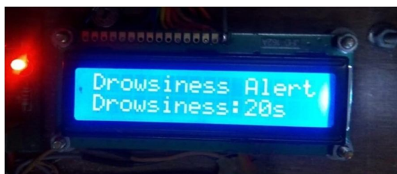
Figure 3. An image showing the drowsiness alert when eye blink is more than 20 sec.