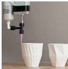
Figure 4: 3d printing of Ceramics

Ceramics are one of the hard, high temperatures resistant and brittle in organic materials used in AM processes. These materials have high compressive strength and exhibits thermal and chemical resistance. Ceramics can be applied to FDM process in which ceramic loaded polymer filaments are used to produce parts and this process is termed as fused deposition of ceramics (FDC). Attempts have been made by using ceramic powders in selective laser melting (SLM) process in which ceramic powders are directly melted to produce complex geometries. Some of the basic ceramics used in AM processes are alumina, silica, zirconia Si_3N_4 ZrB_2 [8]. Hydroxyapatite is a bio compatible ceramic having porous structure suitable for fabrication of tissue scaffolds. Lead zirconate titanate (PZT) is a another kind of advanced ceramic use especially for industrial application Ti_3SiC_2 , a new class of ceramic used to build fully dense parts with good electrical and mechanical properties. Envisiotec Nanocure RC 25(87% ceramic filler)is a ceramic and glass filled resin used in Stereolithography process[8]. Aluminum Nitrate, Mullite and Cordierite are some of the ceramic materials used by cerampilot in France for the manufacture of industrial, electronics and biomedical goods [8].