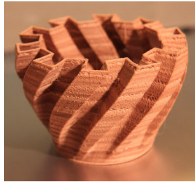
Figure 5: 3d printed wood artefact

Materials which occur in nature are termed as natural materials or naturally derived materials. These materials are applied to Additive manufacturing technologies, which are highly influencing the material world in all fields. Apart from these materials several diverse and distinct materials can be used for 3d printing here some of the materials are discussed which will give a brief idea towards where the technology is moving. Laywood-D3 is a material founded by a company known as KAIPA in Germany which is a mixture of wood powder combined with polymer binders and available in the form of filaments with which 3d printing is possible. This material has very less applications but very good in aesthetics [19].