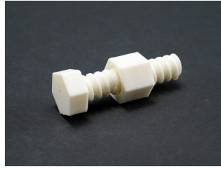
Figure 3 Thermo plastic components

came in to existence like, ABS-M30 with properties like high tensile, impact and flexural strength, 25-70 percent more stronger than standard ABS material. ABS-M30i is a bio compatible and standard material for medical and pharmaceutical applications.