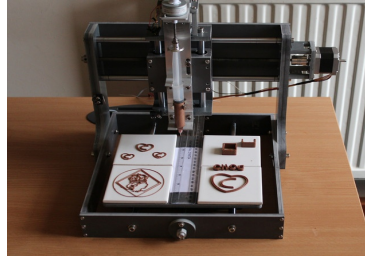
Figure 7: 3d printer using chocolate pastes as a material for printing

Not only materials are derived from nature some of the techniques and orientations are also copied from nature for example researchers at MIT(Massachusetts institute of technology)done experiments to create a robotic controlled extruder which deposits the natural fibers just like Bombyx mori silk worm constructs the cocoon. Researchers from the same institute working to produce 3D printed body armor which is a biomimetic of scales on the body of dragon fish [20].