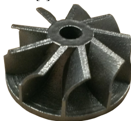
Figure 2: Laser sintered Metallic components

MikeShellbear and Olli Nyrhila of Electro optical systems (EOS) Germany proposed Direct metal20 a Bronze nickel based multi component metal powder which can be processed with minimal layer thickness as low as 20µm. EOS stainless steel PH1 is a material provides high yield strength (approx 1025Mpa) and hardness (30-35HRC). EOS Titanium Ti64 is a light weight pre alloyed Ti6Al4v alloy having good mechanical properties and corrosion resistance for DMLS process [4]. EOS-CobaltchromeP1 is cobalt chrome molybdenum based super alloy exhibits excellent mechanical properties like ultimate tensile strength greater than 1150Mpa and hardness 35-45HRC[4]. Laser formA6 steel material of 3D systems used especially for selective laser sintering exhibits hardness 20-40HRc, shows 2x thermal conductivity faster molding cycles for increased productivity. Other similar material Laser form ST-200 is a special stainless steel composite used to produce durable and dense metal parts, such as tooling inserts. Laser form ST-100 material is also a powdered stainless steel from 3d systems with high durability used to produce prototypes and metal mold inserts [6].