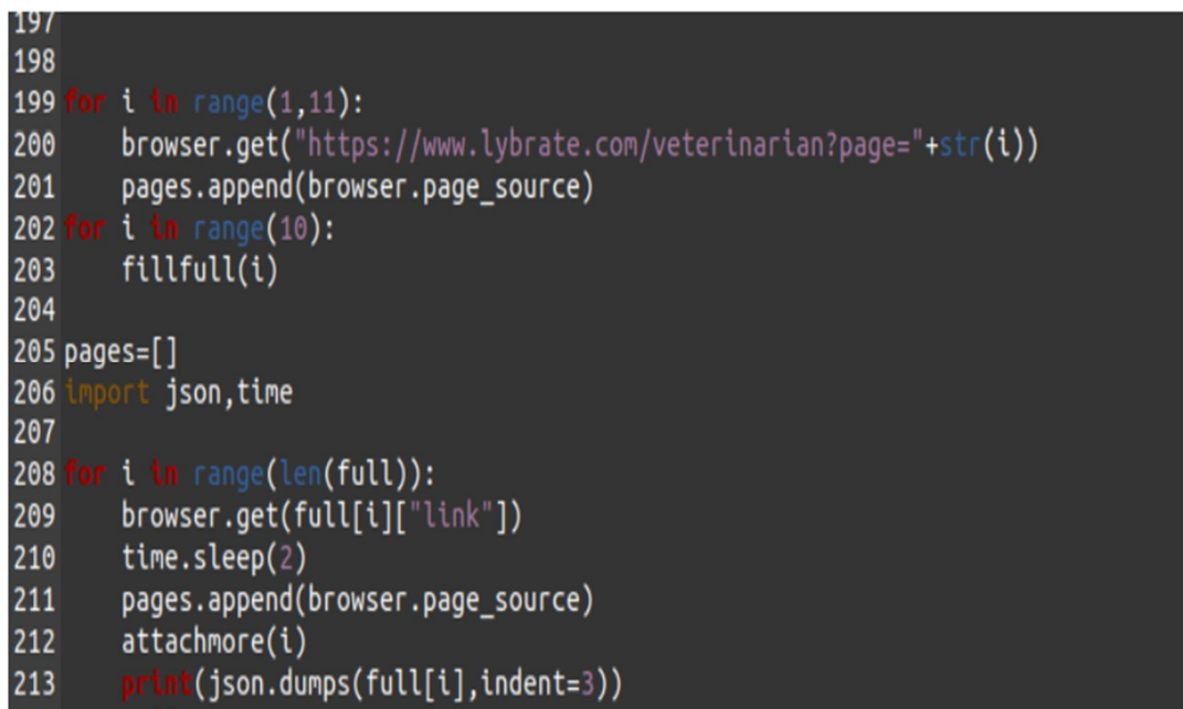
Figure 2: URL Extraction Method