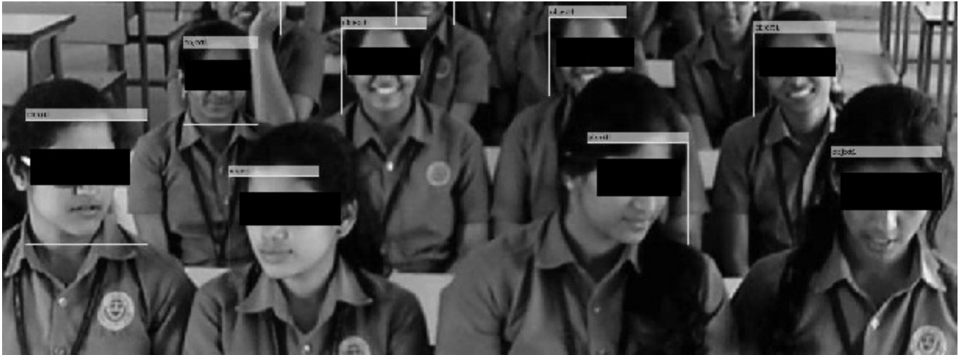
Figure 2. Detected faces