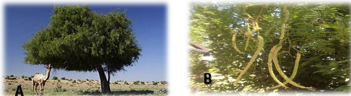
Fig.1: A. Prosopis cineraria (L.) Druce – A state tree of Rajasthan and B. Pods.