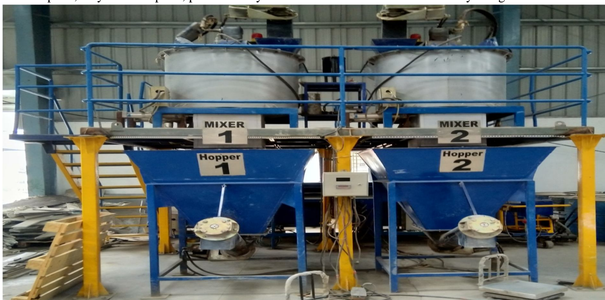
Fig.1 Road marking paint manufacturing machine actual model

Road marking paint manufacturing machines are very similar to the machines used for manufacturing oil-based paints. Road marking paint machine can be defined as two types one is road marking paint applicator and road marking paint manufacturing machine. Simple set up of mixer, hopper, hydraulic power jack mechanism, compressor and electrical panel makes one complete road marking paint manufacturing machine. Different types of paints can be manufactured through this machine. Thermoplastic paint, waterborne paint, acrylic-based paint, primer and synthetic enamel can be manufactured by using this machine.