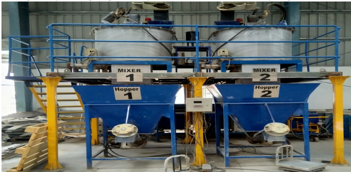
Fig.1 Road marking paint manufacturing machine actual model

Road marking paint manufacturing machines are very similar to the machines used for manufacturing oil-based paints. Road marking paint machine can be defined as two types one is road marking paint applicator and road marking paint manufacturing machine. Simple set up of mixer, hopper, hydraulic power jack mechanism, compressor and electrical panel makes one complete road marking paint manufacturing machine. Different types of paints can be manufactured through this machine. Thermoplastic paint, waterborne paint, acrylic-based paint, primer and synthetic enamel can be manufactured by using this machine.