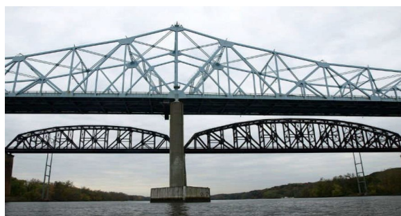
Fig. 3 River Bridge structures coated with TSA