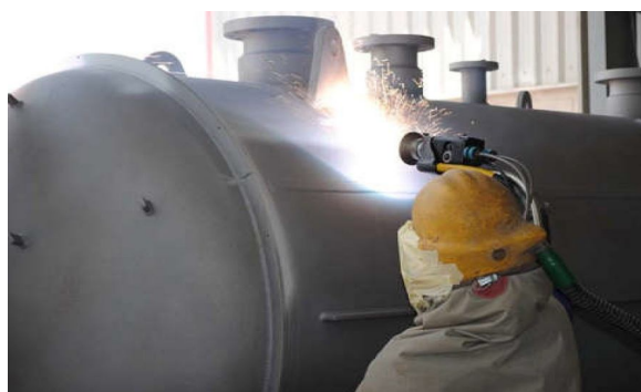
Fig. 4 Oil Refinery Pipelines coating using TSA

The TSA Coatings should provide a minimum of 20 to 30 years reliable service. Thus saving a significant amount on repair, labour and materials. TSA coatings are most cost effective in terms of purity and quality of the product and corrosion related issues in terms of monitoring and controlling the situations leading to lower shell life, and damage to the environment [2].