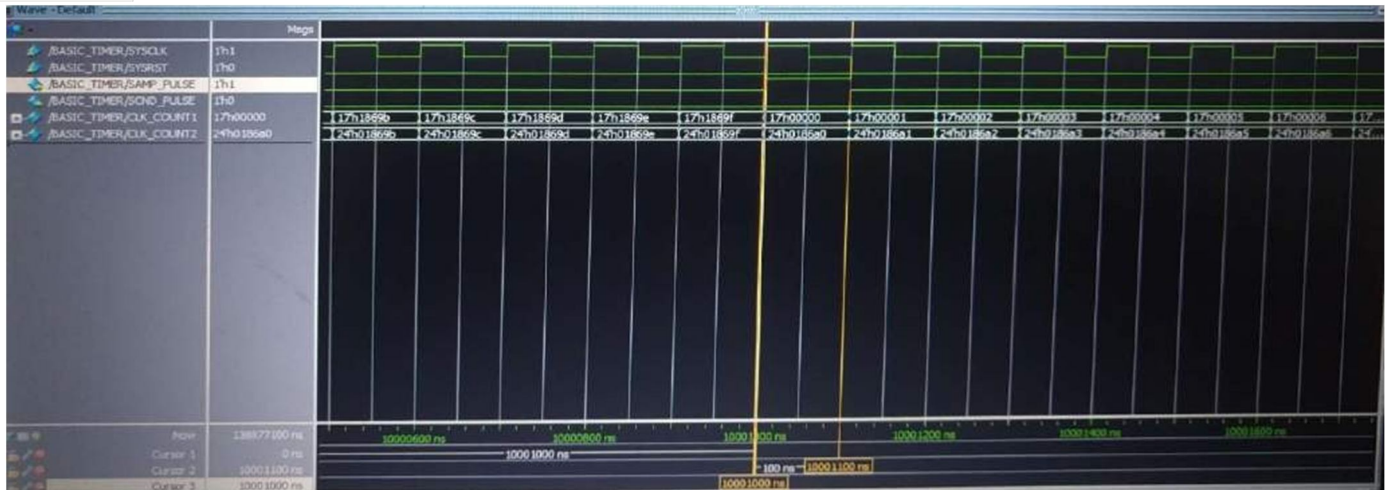
Fig. 6 Result for Timer Pulse Generation

Fig. 6 shows the generation of a timer pulse signal which is a 10ms pulse generated from a 10MHz input signal. It is done for the controlled operation of the system.