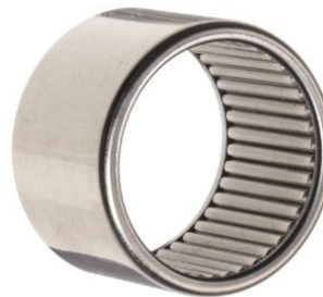
FIG.1 Overview of Needle Roller Bearing

This case study deals with the reduction of defects in the fine grinding process in a Bearing manufacturing company. These Bearings were used in cars, trucks and buses throughout the world. A schematic view of bearing is given in Figure 1.