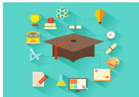
Figure 3. Smart devices of a school.

IoT is additionally utilized in the computerized participation, maintaining the databases of understudy's records, controlling the utilization of school offices, keeping the records of extracurricular occasions. IoT is additionally utilized in empowering the substance conveyance of the material to specific class as it were. Brilliant lightning is likewise taken care of by the IoT, such as changing the indoor lights of the school by seeing outside light examples. Temperature screens are utilized for keeping away from the food wastage in schools, which sets aside time and cash as well. School transports are likewise checked with the assistance of IoT.