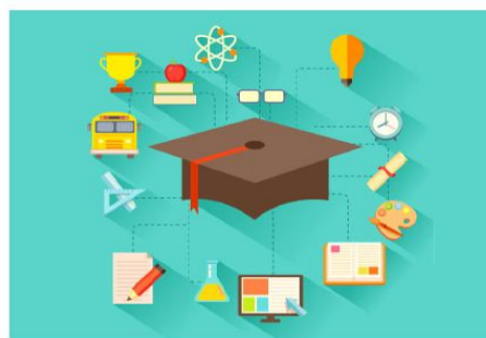
Figure 3. Smart devices of a school.

IoT is additionally utilized in the computerized participation, maintaining the databases of understudy's records, controlling the utilization of school offices, keeping the records of extracurricular occasions. IoT is additionally utilized in empowering the substance conveyance of the material to specific class as it were. Brilliant lightning is likewise taken care of by the IoT, such as changing the indoor lights of the school by seeing outside light examples. Temperature screens are utilized for keeping away from the food wastage in schools, which sets aside time and cash as well. School transports are likewise checked with the assistance of IoT.