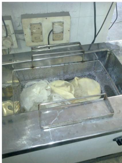
Figure 2: Samples under treatment in Ultrasonic machine

The potential of ultrasonic cleaning in conservation has been recognized for some time. Barton et. al. (1986), reported that archaeological conservation in Europe has resorted to this type of cleaning in dealing with waterlogged wood, textiles and leather artefacts. The principle of ultrasonic cleaning is the generation of mechanical impulses through a liquid at high frequencies. These impulses create minute bubbles of vacuum which implode against the immersed object, creating shocks which clean its surface (Dallas, 1976). Thus ultrasonic cleaning technique is effective while remaining gentle in terms of time and handle. Therefore the possibility of using ultrasonic cleaning technique for removal of superficial damaged layer of aged fabrics was explored to restore whiteness without considerable strength loss.