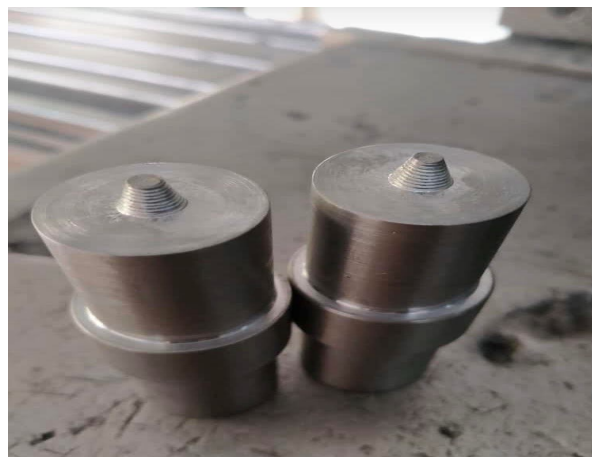
Figure 2: A taper cylindrical tool profile

Over the years, researchers have recognised that pin profile of tool is important factor which influences the grain size distribution and various other attributes of the weldment. Primarily the FSW tool serves two purposes viz. the flow of material and localised heating. It also influences the higher temperatures attained during FSW process, energy required etc. In this regard [19] carried out research for AA7075 T6 simply to find the optimum shoulder diameter of the tool. It was inferred that with increase of shoulder diameter the highest temperatures attained during FSW process also increases. Perfect diameter of the tool shoulder was evaluated for different rpm. For 355 rpm corresponding tool shoulder diameter was 30mm, for 560rpm corresponding tool shoulder diameter was 25mm and for 710rpm corresponding tool diameter was 20mm respectively. Energy required for above combinations was also high. Peak temperatures attained were well under limits for conventional FSW.