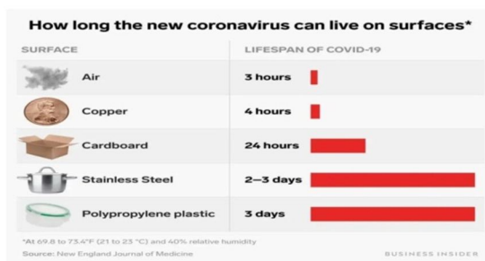
Fig 1:- life span Covid-19 on different material surfaces

It is evident that the life time of corona virus ranges from 3 hours to 72 hours. It depends on the contact layer with which corona virus come in contact with hard, porous, non-porous, metallic, soft structure material.