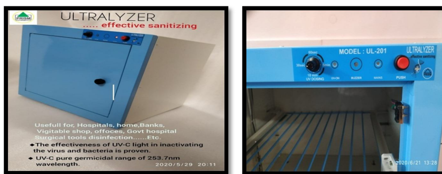
Fig 3: Ultralyzer manufactured in Prism lab:-Model: UL-201 range of 253.7 wavelengths