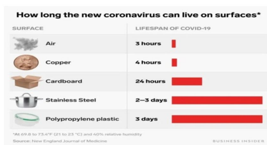
Fig 1:- life span Covid-19 on different material surfaces (adopted from Business insider Newspaper/Magazine)

It is evident that the life time of corona virus ranges from 3 hours to 72 hours. It depends on the contact layer with which corona virus come in contact with hard, porous, non-porous, metallic, soft structure material.