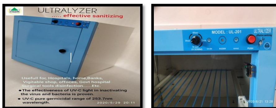
Fig 3: Ultralyzer manufactured in Prism lab:-Model: UL-201 range of 253.7 wavelengths